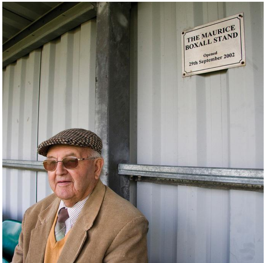
The Maurice Boxall Stand was built with the proceeds of the Robins 2001 run to the Third Qualifying Round