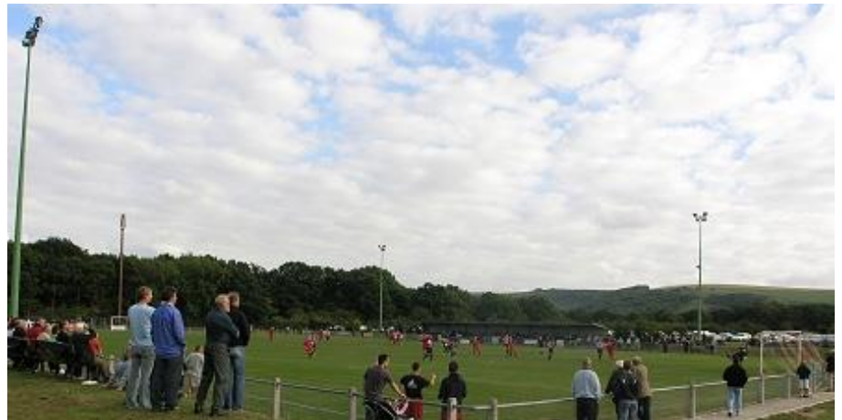
A bumper crowd of over 300 pack out the Beacon for a second qualifying round tie with Dulwich Hamlet in 2005