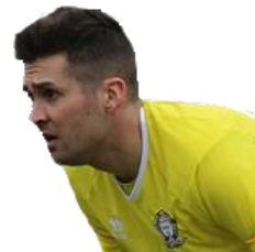
Haig Kingston Sponsorship Available