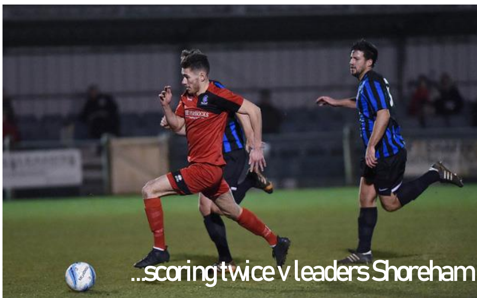
...scoring twice v leaders Shoreham