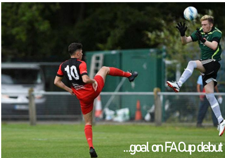
...goal on FA Cup debut