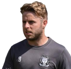
Mark Price Sponsorship Available