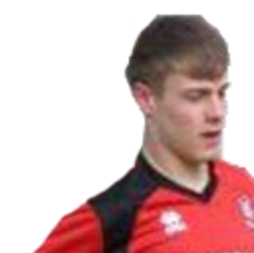
George Brown Sponsorship Available