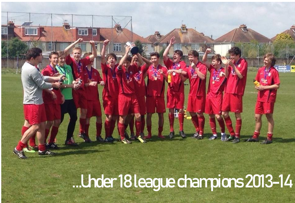
...Under 18 league champions 2013-14