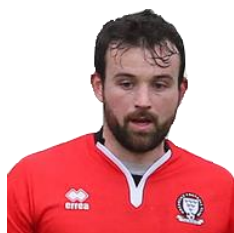
Will Broomfield Sponsorship Available