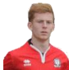
Joe Bull Sponsorship Available