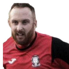
Dan Jacques Thompson Plumbing & Heating