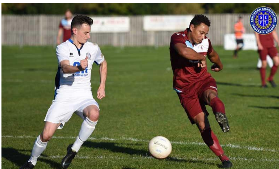
Southern Combination Football League