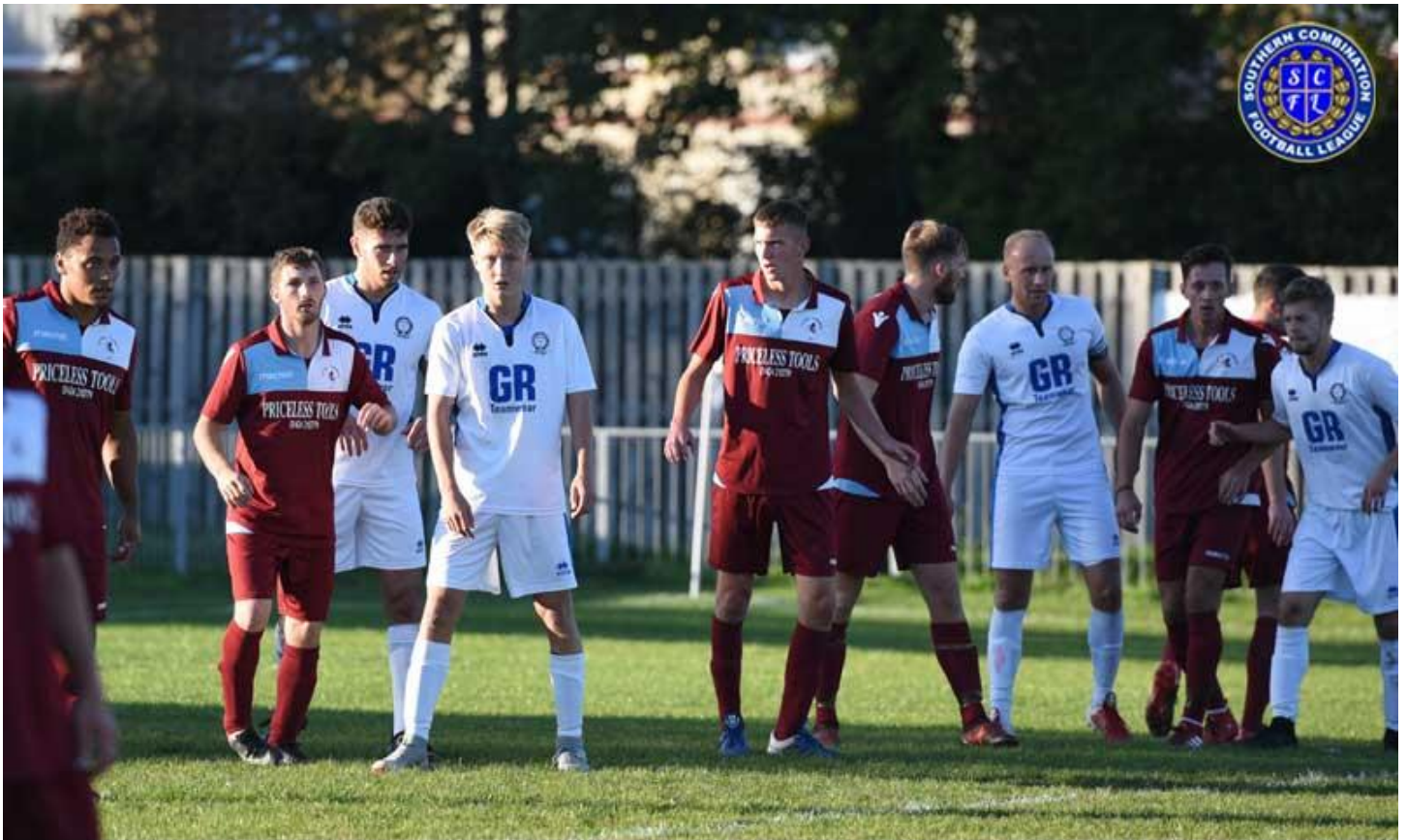
Southern Combination Football League