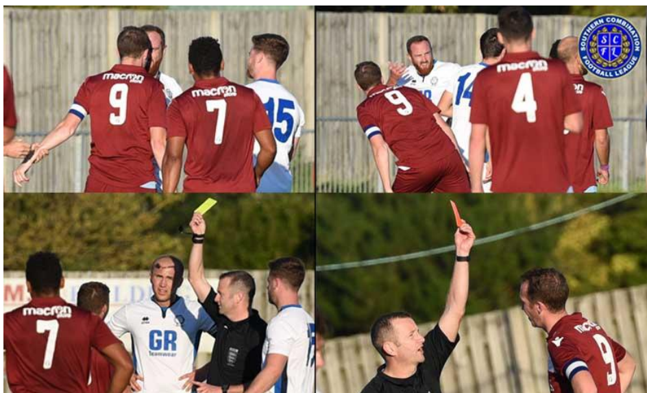
Southern Combination Football League