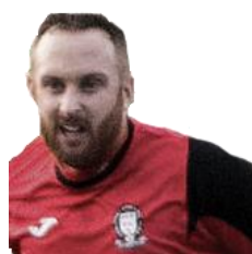
Dan Jacques Thompson Plumbing & Heating