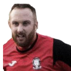
Dan Jacques Thompson Plumbing & Heating