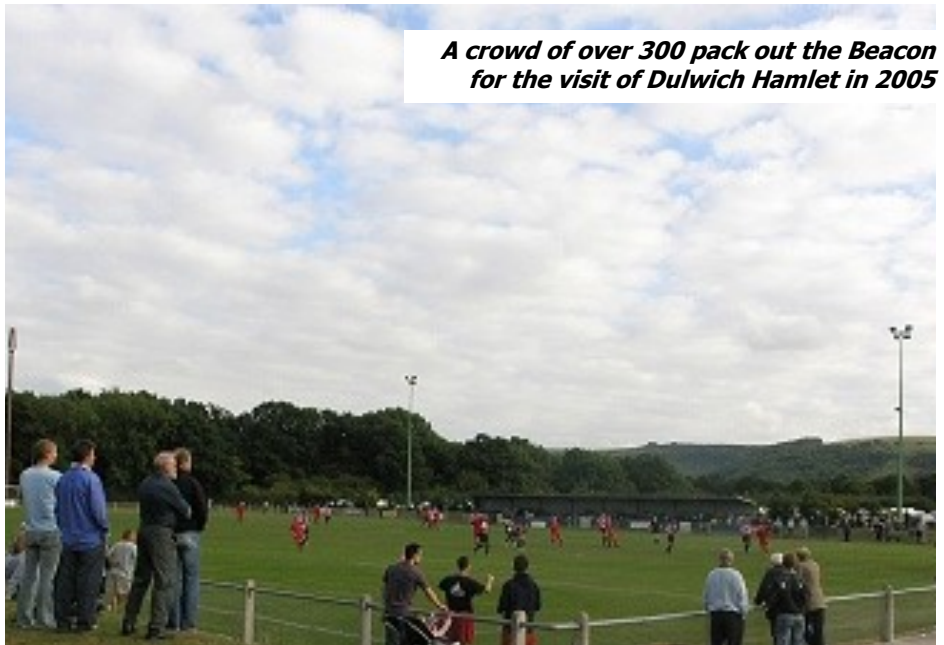
A crowd of over 300 pack out the Beacon for the visit of Dulwich Hamlet in 2005