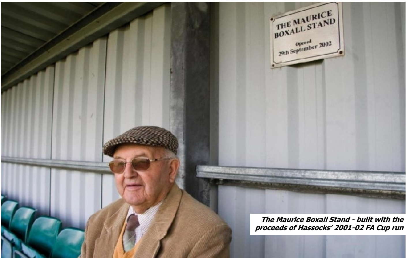
The Maurice Boxall Stand - built with the proceeds of Hassocks' 2001-02 FA Cup run