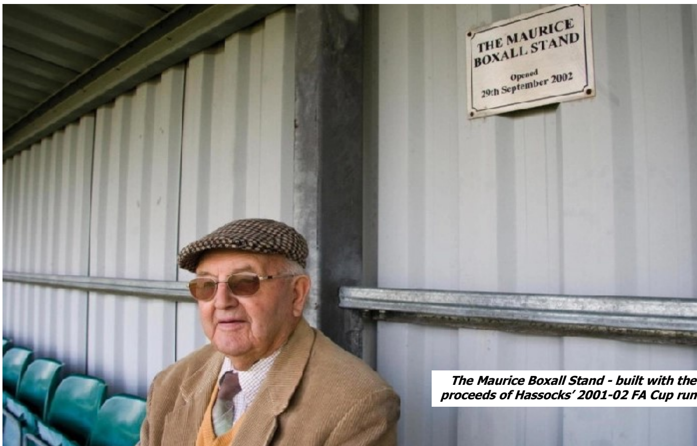
The Maurice Boxall Stand - built with the proceeds of Hassocks' 2001-02 FA Cup run