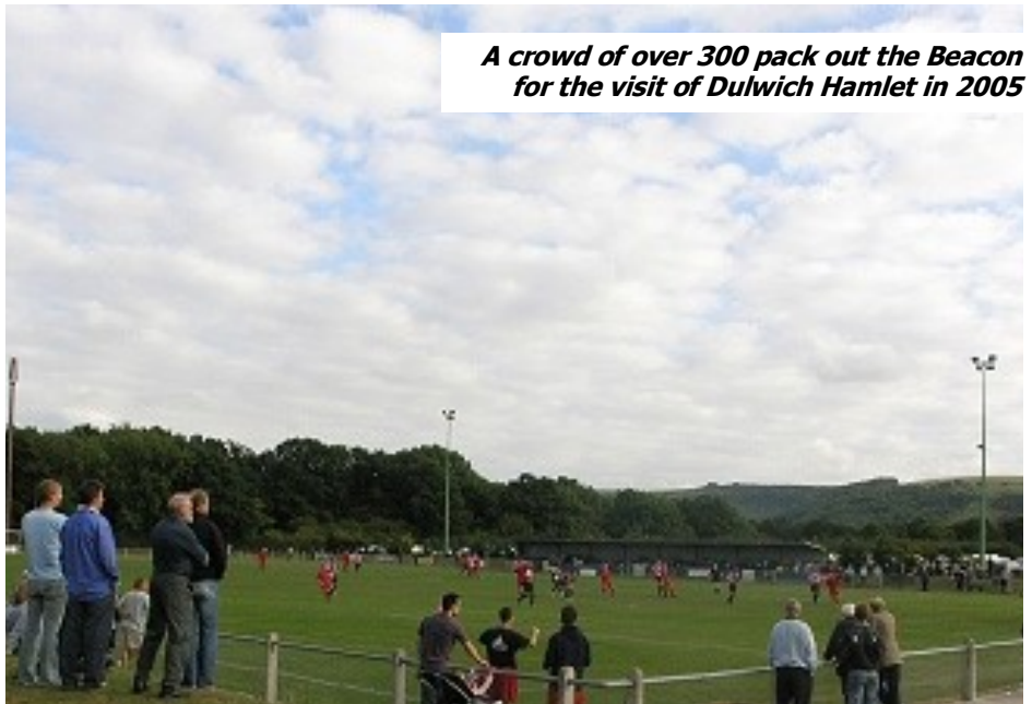
A crowd of over 300 pack out the Beacon for the visit of Dulwich Hamlet in 2005