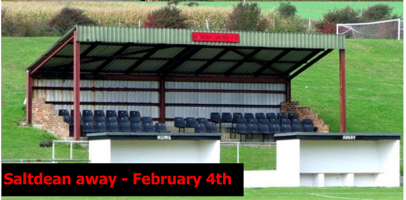
Saltdean away - February 4th