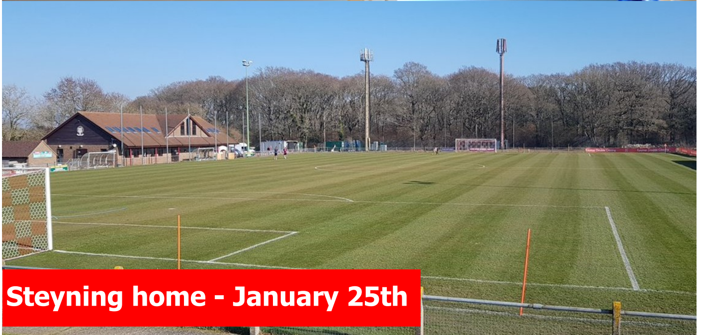
Steaying home - January 25th