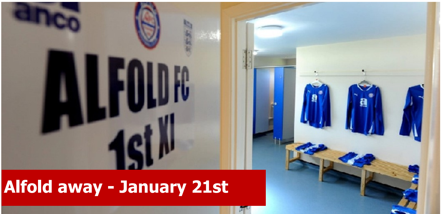
Alfold away - January 21st